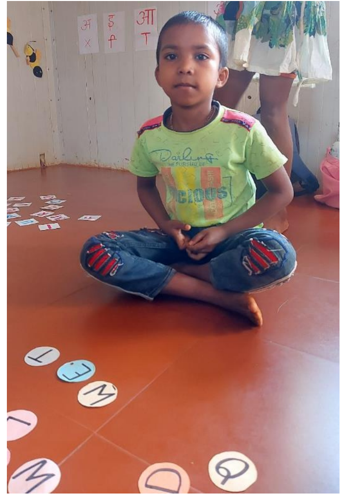
read 3- lettered words with short vowel. (For more information please refer to the group report)