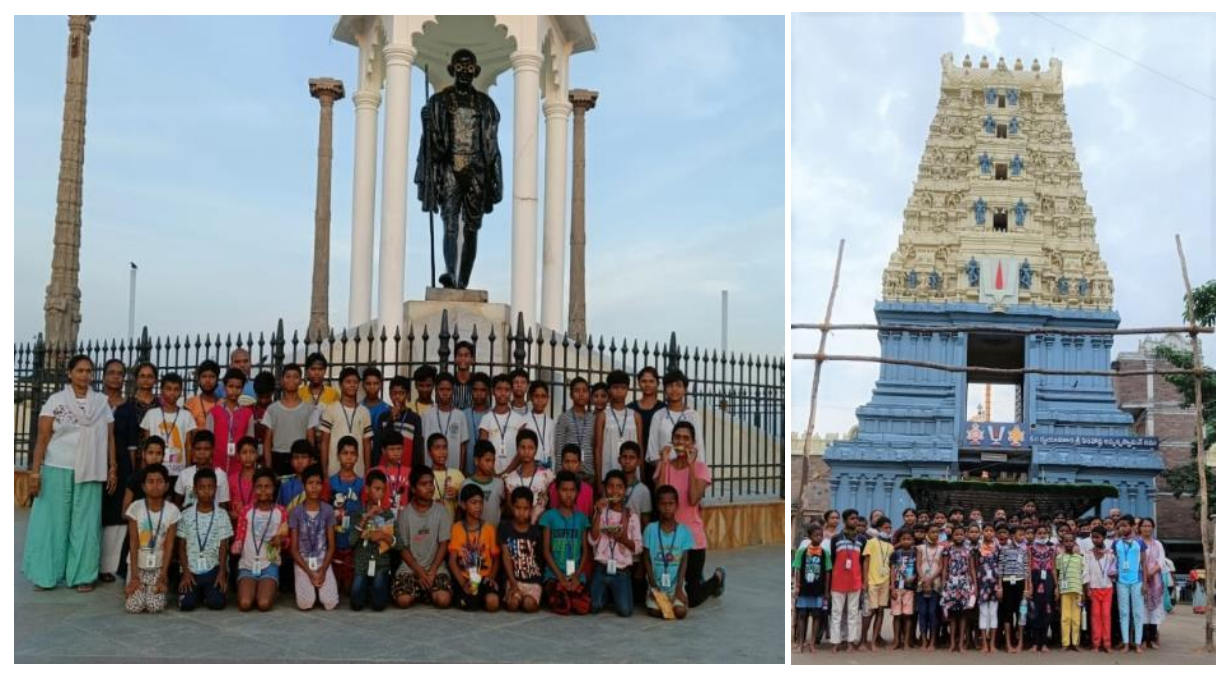
Eye hospital. After this, the children went to Puducherry and stayed at the Delhi House. The food at the Ashram was good. All of them went